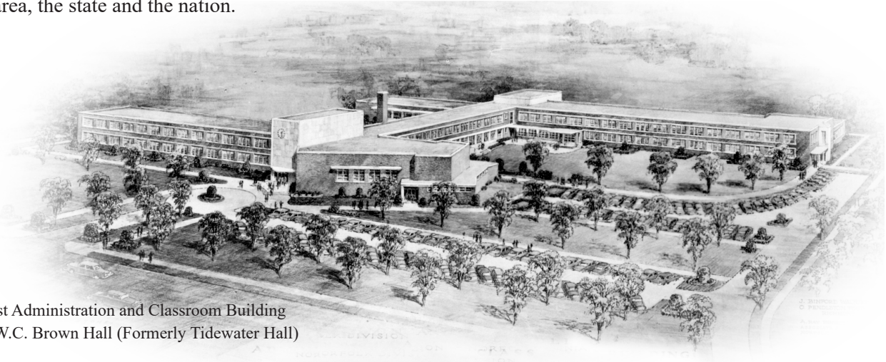
First Administration and Classroom Building G.W.C. Brown Hall (Formerly Tidewater Hall)

In 1942, the College became the independent Norfolk Polytechnic College, and two years later an Act of the Virginia Legislature mandated that it become a part of Virginia State College. The College was able to pursue an expanded mission with even greater emphasis in 1956 when another Act of the Legislature enabled the institution to offer its first baccalaureate degree. The College separated from Virginia State College and became fully independent in 1969. Subsequent legislative acts designated the institution as a University in 1979 and authorized the granting of graduate degrees. Today, the University is proud to be one of the largest predominantly black institutions in the nation. Furthermore, it is committed to pursuing its vital role of serving the people of the Hampton Roads area, the state and the nation.