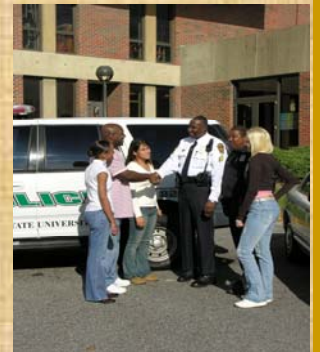
Promoting Safety Awareness

To acquaint students with experiences and concerns of their peers regarding “Safety Awareness” and to directly challenge students to think about proactive measures.