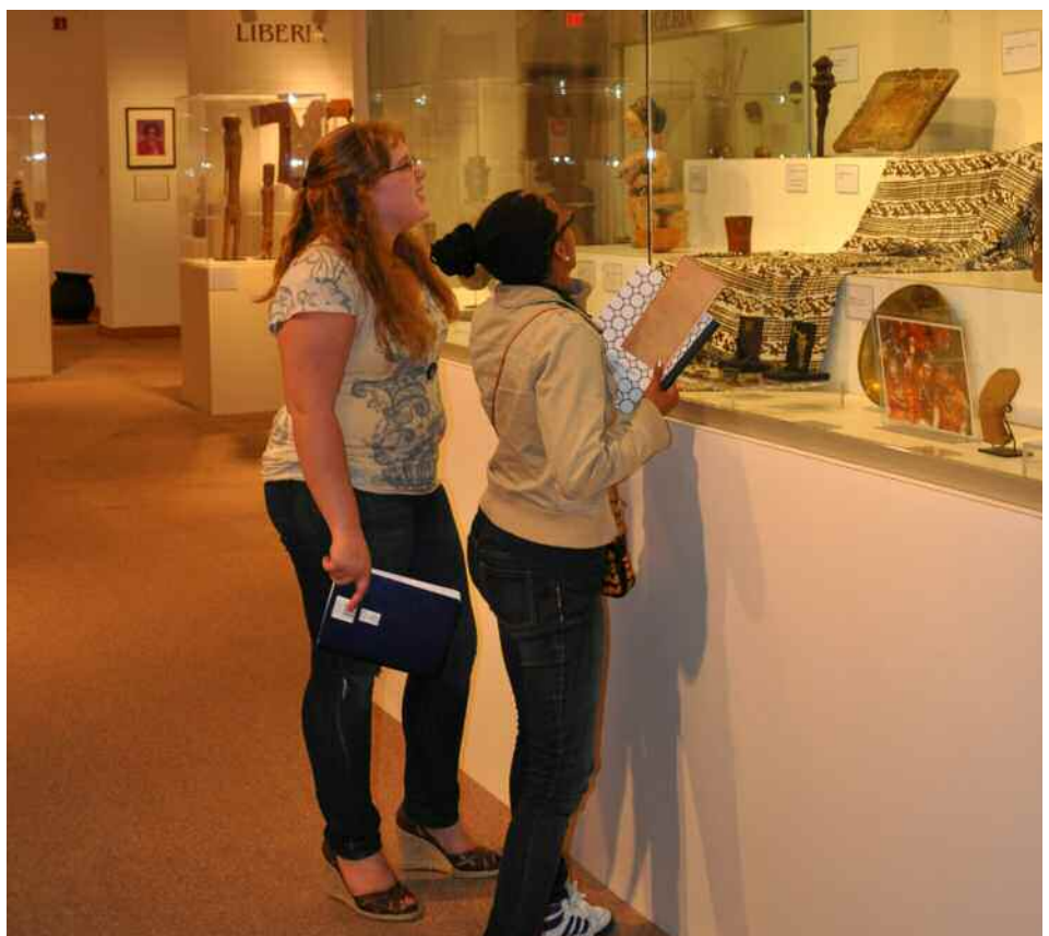
Two girls participating in HonorsForKids study art in one of the cases at the University's African Art Gallery. After studying the pieces, the participants wrote about their experiences.