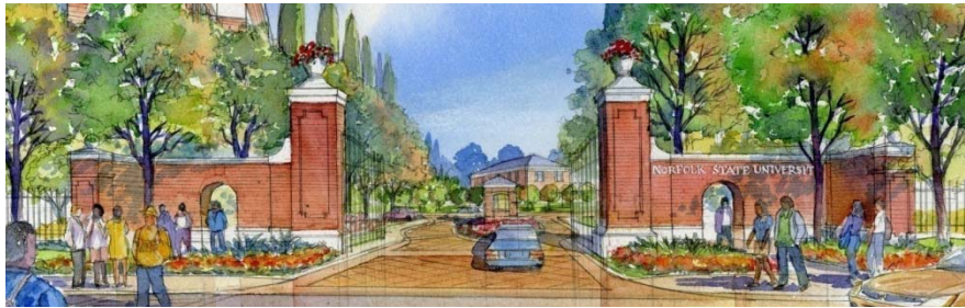
Entrance Gate 1 – Presidential Parkway